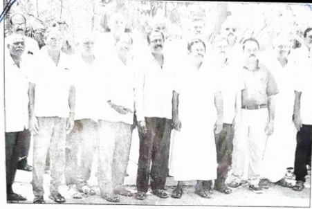
நாமக்கல் அண்ணா அரசு கலைக்கல்லூரியில் 40 ஆண்டுகளுக்கு முன்பு பட்டப்படிப்பு படித்த முன்னாள் மாணவர்கள் சந்தித்து குழுப் போட்டோ எடுத்துக்கொண்டனர்.

We are delighted to announce that during the alumni meeting, the 1978-1981 batch students made a generous contribution of Rs. 10,000.00 specifically designated for the purchase of a digital weighing machine for our department. This modern equipment will significantly enhance the practical learning experiences of our current and future students, enabling them to acquire valuable skills and knowledge in their respective fields.